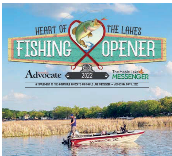
Watch the Annandale Advocate and Maple Lake Messenger for your 2023 Fishing Opener resource guide set to come out on May 10th and make the best of this year's fishing season.