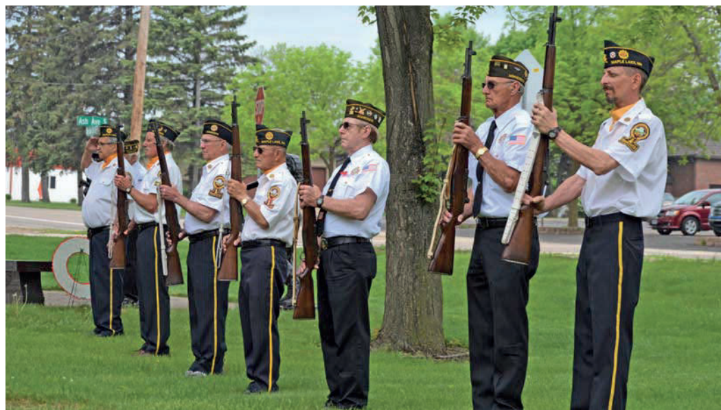
Fallen soldiers are honored at Maple Lake's service with prayers, music and a 21-gun salute.

The program includes songs by the Maple Lake High School Band, prayers, a 21-gun salute and words from a featured speaker. A list of servicemen and women killed in