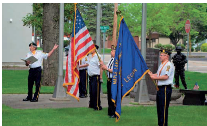
Maple Lake will hold a Memorial Day Service in the morning on Monday, May 29 at the Community Park.

• Confederate soldiers were honored, too. Confederate losses during the Civil War outnumbered Union losses, and those losses were not forgotten