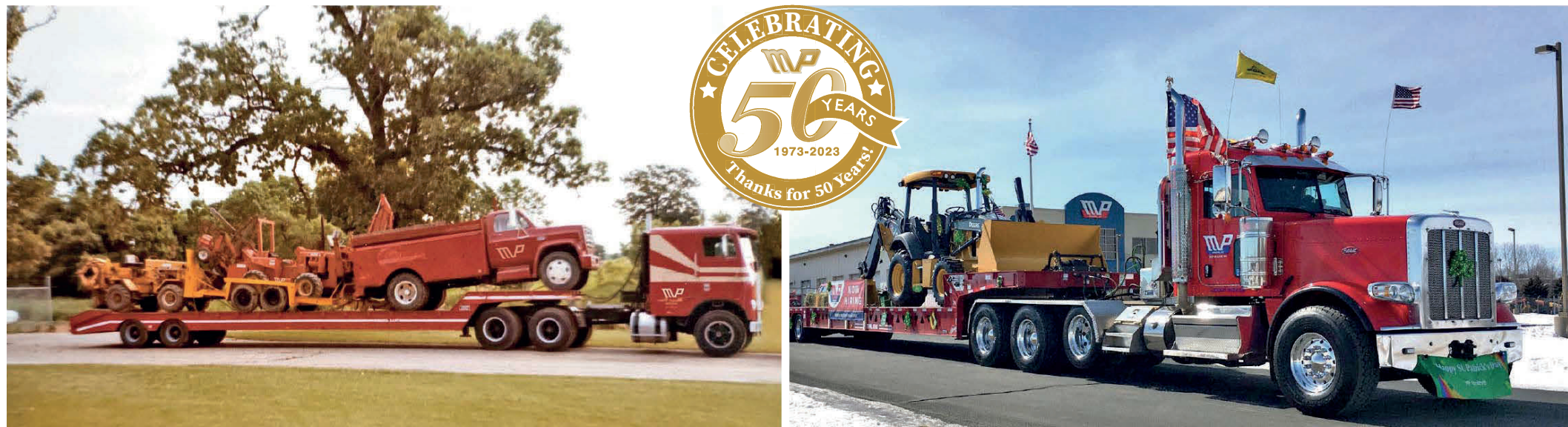
MP was founded 50 years ago with a backhoe and a dump truck. Today it is a multi-million-dollar, full service, utility contracting operation.