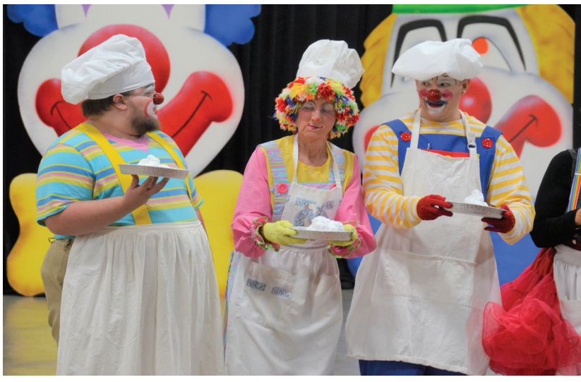
Wanna-be clowns come from as far as Canada and as close as Maple Lake for the weeklong camp. For many, the All Star Clown show will be the biggest event they ever perform in.

The show itself is a delight to the senses with colorful costumes,