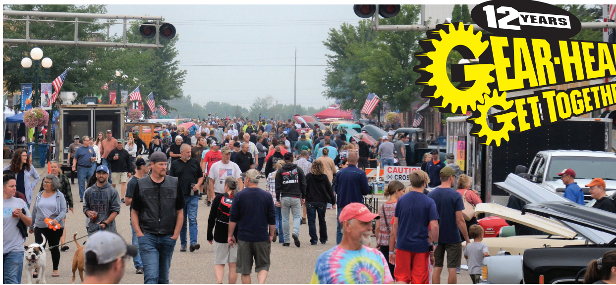
The streets of Maple Lake look like the state fair with all the crowds of people that visit for the annual Gear-Head Get Together. This year's car show and much, much more takes place Saturday, Aug. 19 from 8 a.m. to 6 p.m. in downtown Maple Lake.

There are enough shiny hot rods, collector cars, rusty re-models still in the works, motorcycles of all eras and intriguing odds and ends to take over the entire town. Streets are closed for the event to accommodate 1,000 plus vehicles and motorcycles plus the