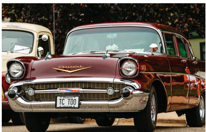
Find classic cars at Annandale Cruise-Ins Aug. 11 and Sept. 8.

For more information, visit the Facebook page heartofthelakescruisein or call 952-451-2104.