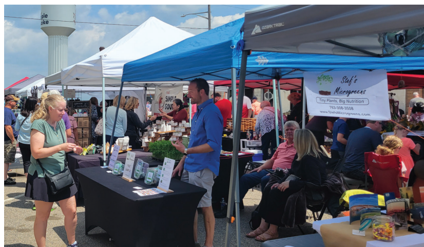
The Makers and Growers Market in Maple Lake has exceeded expectations with more new and unique vendors at every event. Check out this month's market on Sunday, August 13th.

"We're going to flood the streets with booths; it's gonna be like Gear-Head all over again," predicted Denise Blizil, one of the events