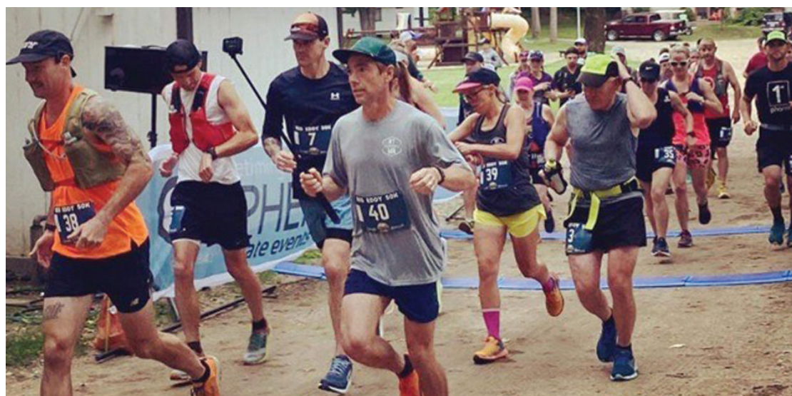
Runners round a turn in the 50 kilometer Eddy Trail Run last year.

Eddy Trail Races offers onsite lodging on both Friday and Saturday nights in different settings,