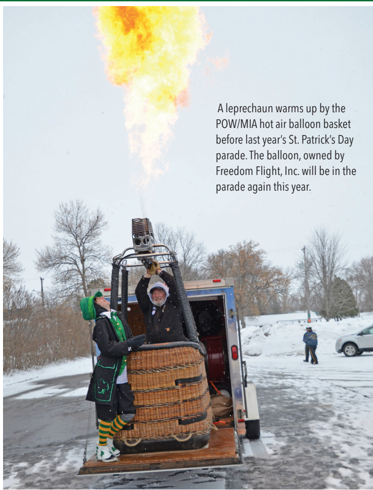
A leprechaun warms up by the POW/MIA hot air balloon basket before last year's St. Patrick's Day parade. The balloon, owned by Freedom Flight, Inc. will be in the parade again this year.