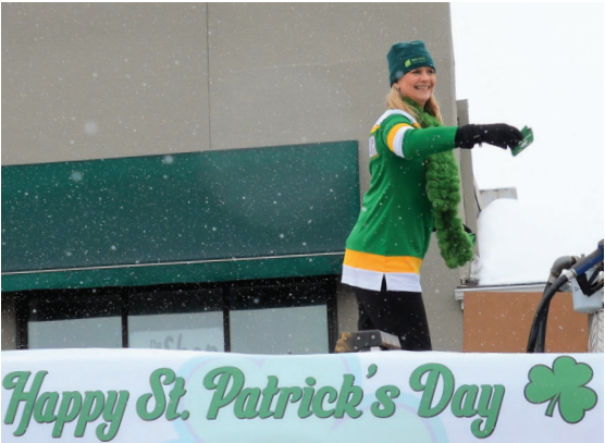
City of Maple Lake - Mayor Lynn Kissock