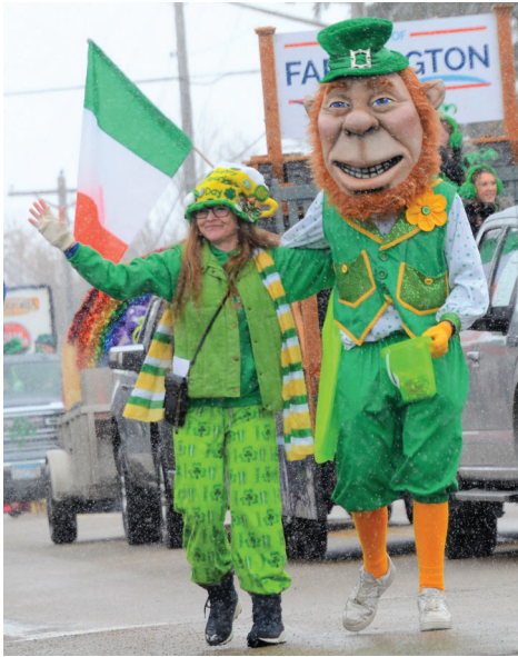
The Costume Shoppe in Maple Lake