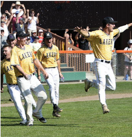
Maple Lake Lakers – 2023 State Champions