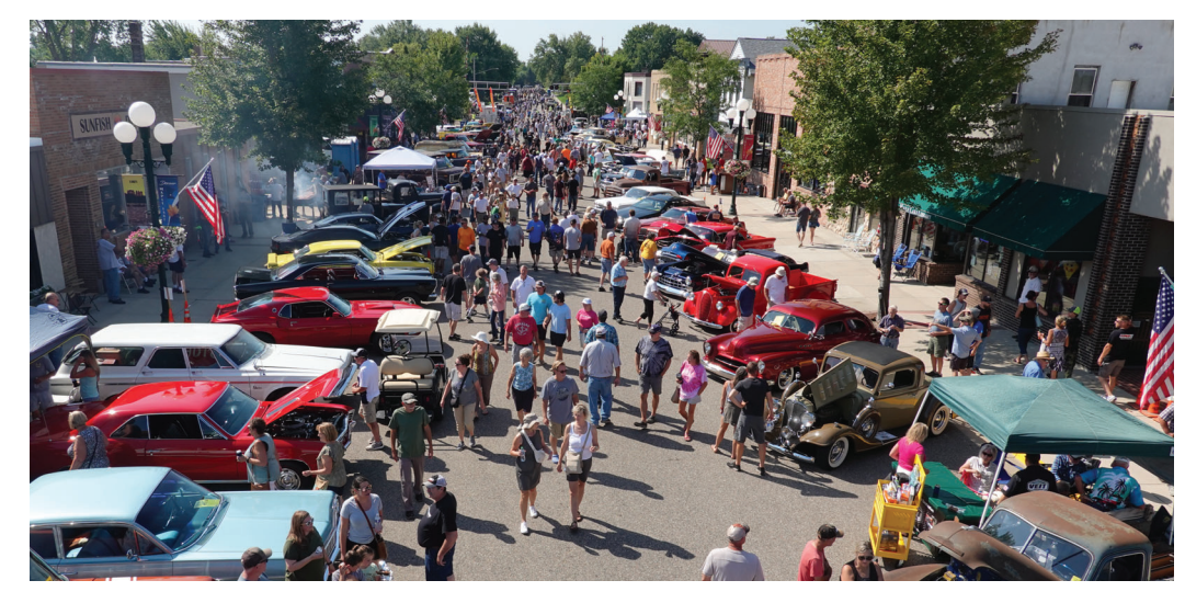
Last year's Gear-Head Get Together drew the largest crowds yet with an estimated 1,500 vehicles, rat rods, motorcycles and oddities for state-fair sized crowds to ooh and awe over. This year's event takes place Saturday, Aug. 17 in downtown Maple Lake and looks to be just as exciting.