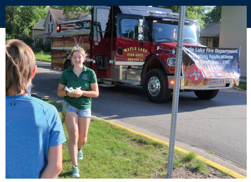
On Tuesday, August 6, the Maple Lake Fire Department will hand out frozen treats during National Night Out in Maple Lake. The annual event aims to build relationships between law enforcement, first responders and the community.

Annandale celebrates National Night Out in about a half a dozen neighborhoods throughout the city. Annandale police and fire and rescue take part and there is food, games and fun activities for families and chil-