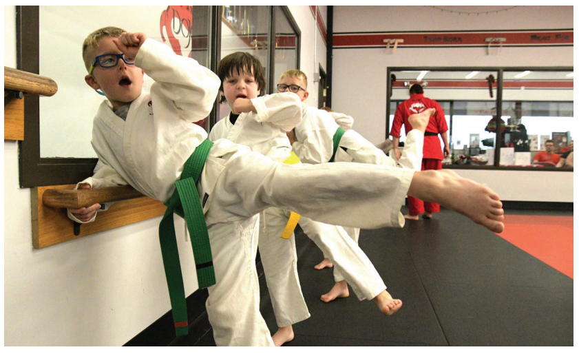
Children and adults enjoy the benefits of karate, many families are drawn to the activity for its focus on self-confidence, discipline and self-control, plus it's lots of fun.

For the Custers, pictured above, Dojo Karate in Buffalo provides an activity the entire family can enjoy together.