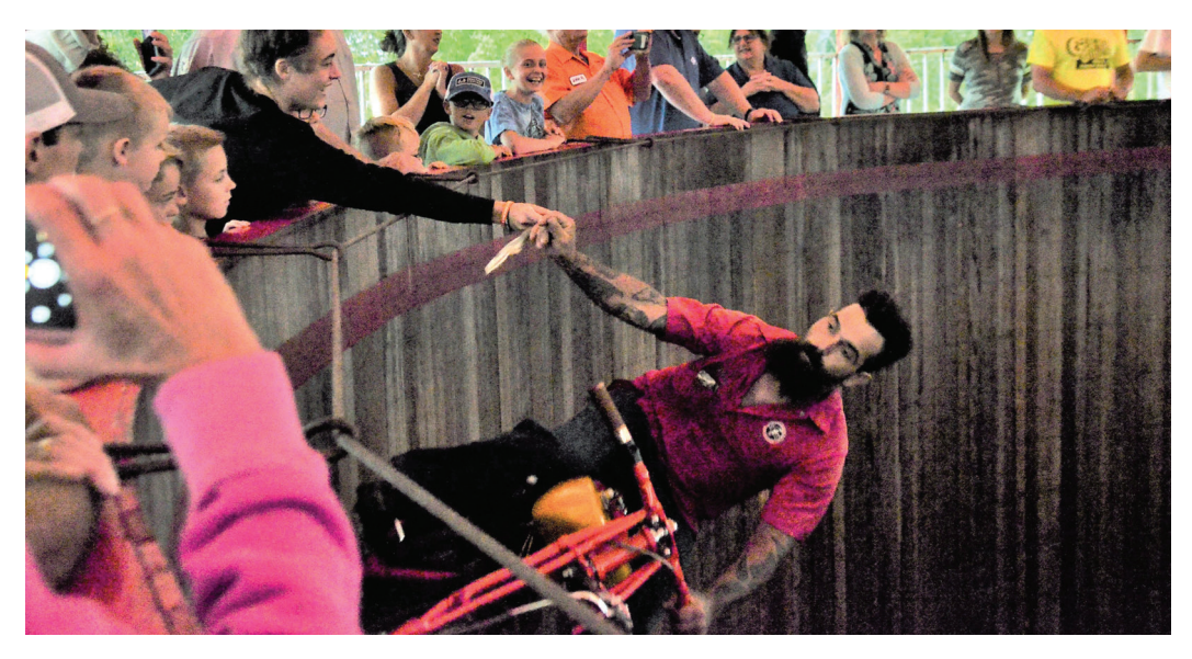
The American Motor Drome Company returns to this year's Get Together with death-defying performances throughout the day on the Wall of Death.